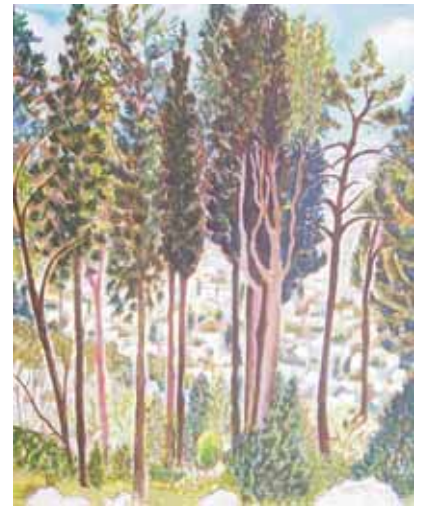
Jerusalem Forest acrylic on canvas - 24"x30" $650