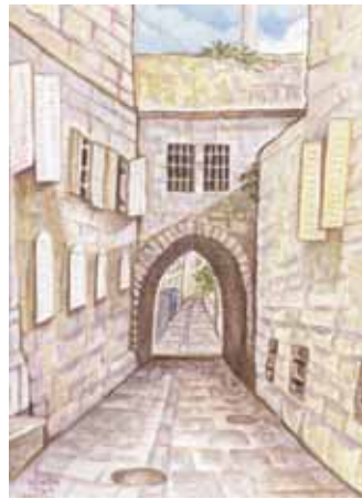
Jerusalem Alley acrylic on canvas - 9"x12" $175