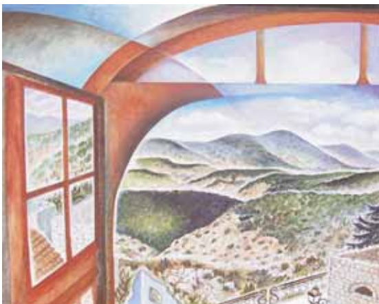
Tzfat Window (2) acrylic on canvas - 30"x24" $400

8.5"x11" POSTERS ARE AVAILABLE! $12 each inquire in WJC office or email durga@durgabernhard.com