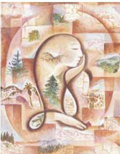
Returning from Israel acrylic & collage on canvas - 11"x14" $400

TO VIEW MORE ART BY DURGA YAEL VISIT durgabernhard.com TO LEARN ABOUT DURGA'S CHILDREN'S BOOKS, PLEASE VISIT durgabernhard.com/bookblog