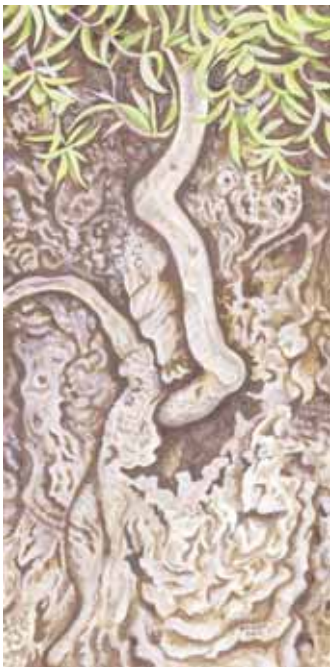
Resurrection (Ancient Olive, Garden of Gethsemane) acrylic on canvas - 10"x20" $350