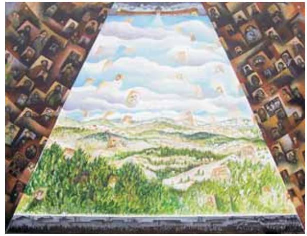
From Darkness to Light (View from Yad Vashem) acrylic on canvas - 40"x30" $2500