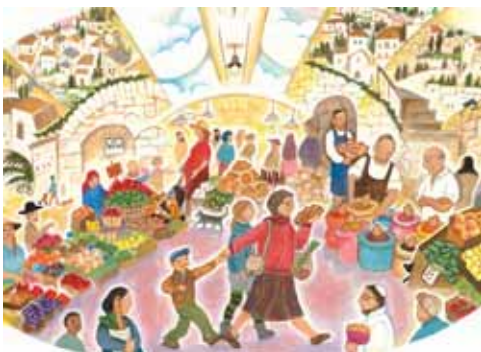
Machane Yehuda gouache painting on paper original illustration from the artist's new children's book AROUND THE WORLD IN ONE SHABBAT (Jewish Lights Publishing, 2011) 17"x11" $400