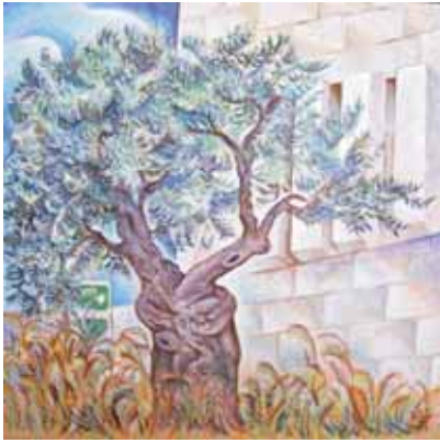
City Olive acrylic on birch wood - 20"x20" $375