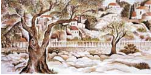
Valley of the Cross, Jerusalem acrylic on canvas - 30"x15" $300