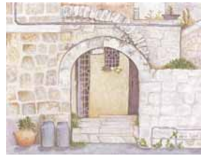
Doorway, Jerusalem acrylic on canvas - 14"x11" $225