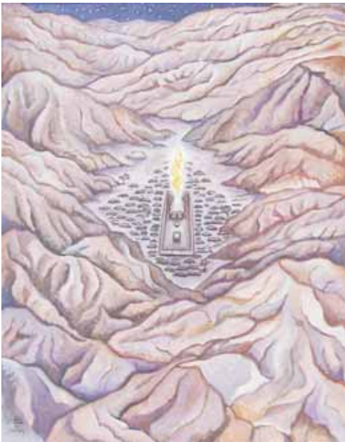
Bamidbar (In the Wilderness) acrylic on canvas - 24"x30" $1200