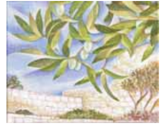
Olives in August acrylic on canvas - 10"x8" $75