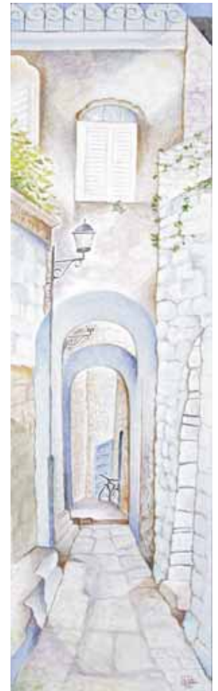
Blue Alley, Tzfat acrylic on canvas 12"x47" - $550

8.5"x11" POSTERS ARE AVAILABLE! $12 each inquire in WJC office or email durga@durgabernhard.com