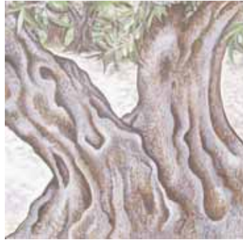
Olive Trunk acrylic on canvas - 20"x20" $125