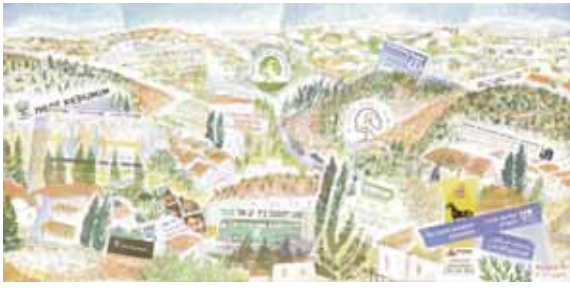
Arriving in Jerusalem acrylic on canvas - 20"x10" $350