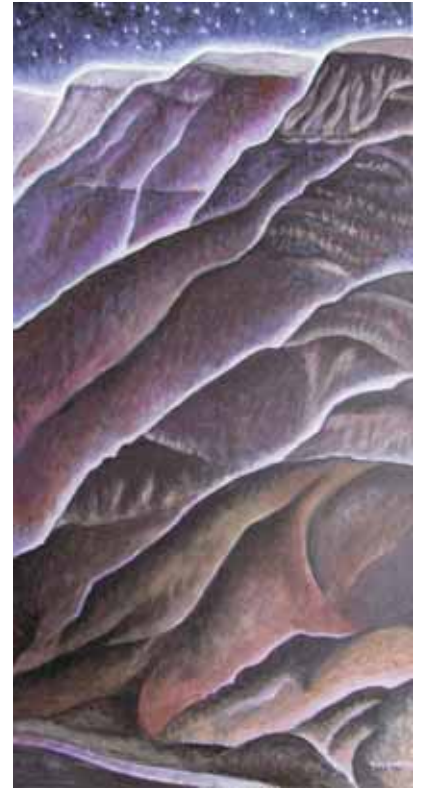
The Road to Masada acrylic on canvas 18"x36" $575