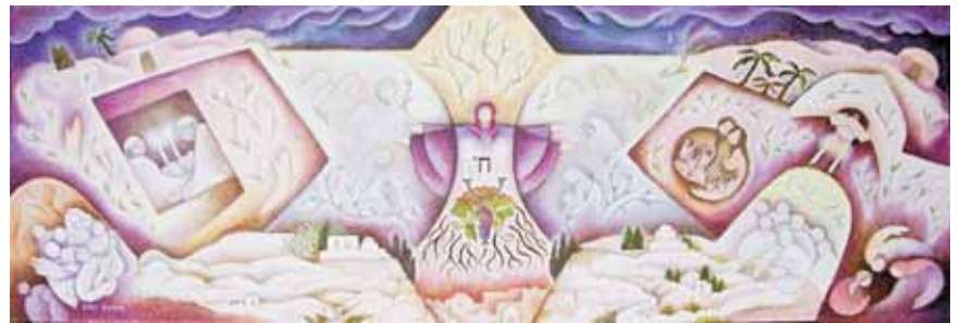
The Sabbath Bride (located in lobby over entrance to hallway) acrylic on canvas 61"x21" $1200 framed