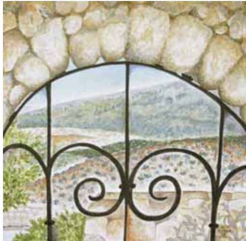
Tzfat Window (1) acrylic on canvas - 20"x20" $750