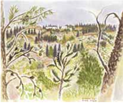
View from Ne'ot Kedumim (1) gouache painting - 11"x9" NFS