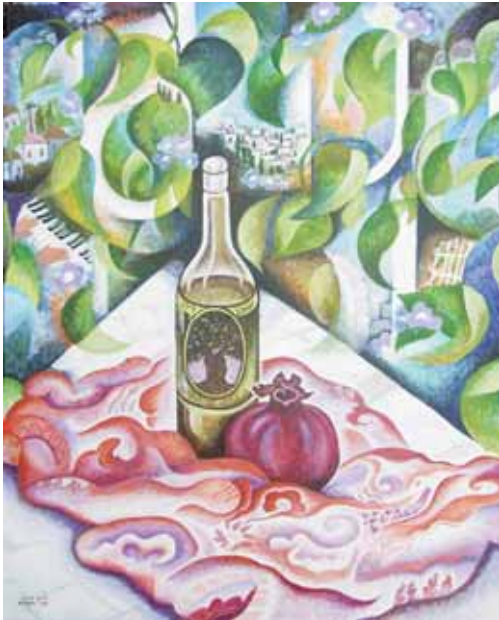
Still Life, Jerusalem acrylic on canvas - 24"x30" $850