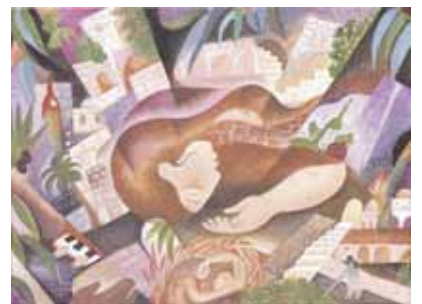
Sleeping in Rechavia acrylic on canvas - 16"x12" - $275