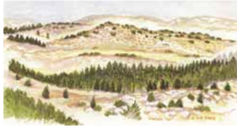
View from Ne'ot Kedumim (2) gouache painting - 11"x6" $100