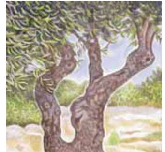
Young Olive Tree acrylic on canvas - 12"x12" $100